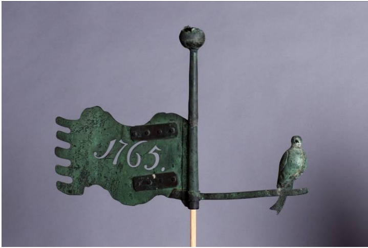
Historic Hudson Valley. Weather vane , probably the Netherlands, dated 1765, Copper.