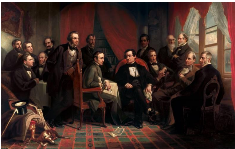
Historic Hudson Valley. Christian Schussele (c. 1825-1979), Washington Irving and his Literary Friends , Philadelphia, 1863, Oil on canvas, Gift of John D. Rockefeller, Jr.