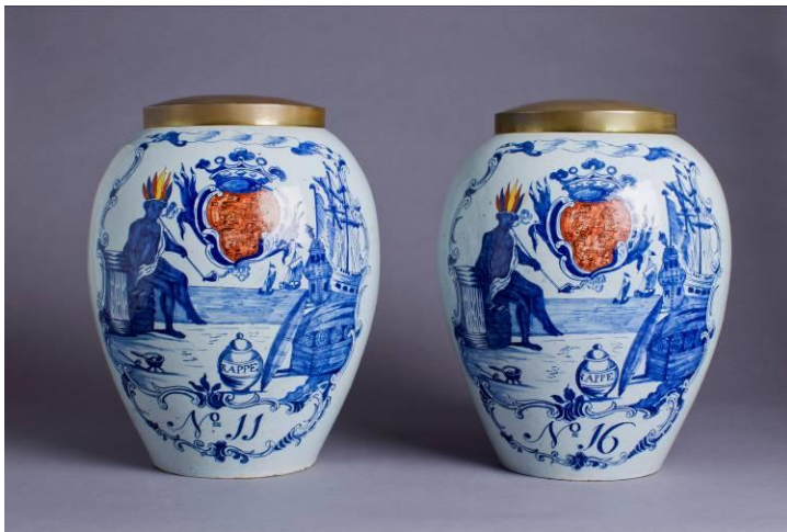
Historic Hudson Valley. Pair of tobacco jars , Probably Delft, the Netherlands, c. 1750, Tin-glazed earthenware.